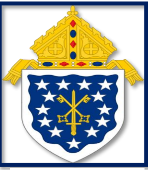
Diocese of St. Thomas in the US Virgin Islands

#81 Estate Elizabeth, P. O. Box 304983, St. Thomas, VI 00803