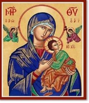
Our Lady of Perpetual Help